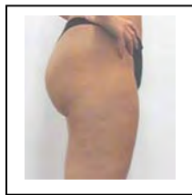
AFTER (8 sittings)